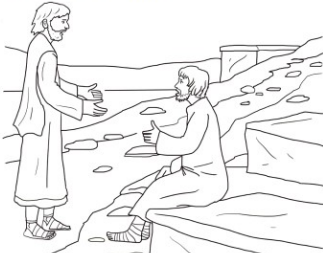
The man who was healed sits quietly, listening to Jesus.

Jesus' healing of a man with mental illness shows what power Jesus has to heal the whole world in different ways.