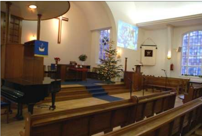
Our church in Christmas time

I was a Christian who was blind, holding a child who was not. I felt it was God asking . . . "Are you willing to share your son for a moment?", when HE shared HIS for an eternity. The ragged old man, unwittingly had reminded me, "To enter the Kingdom of God, we must become as little children."